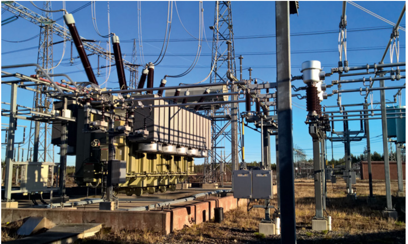
The Optimus DGA Monitor is the right solution for safe guarding critical transformers in harsh environments